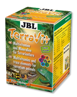
JBL TerraVit Powder Vitamins and trace elements for terrarium animals