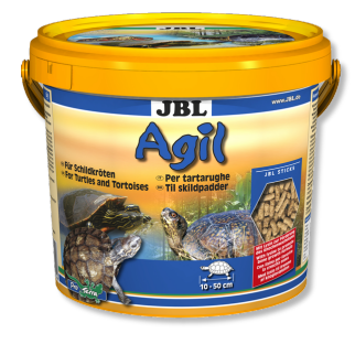
JBL Agil Main foodsticks for turtles 10 – 50 cm in size