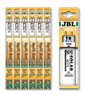
JBL SOLAR REPTIL SUN T8

Special T8 terrarium fluoresc tube for desert animals