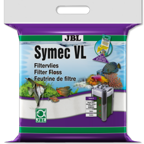
JBL Symec VL Filter wool fleece to remove water cloudiness