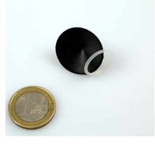
Spare part kit for JBL CO2 Permanent Suction cup & seal ring for the CO2 permanent test