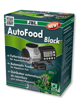
JBL AutoFood BLACK Black automatic feeder for aquarium fish