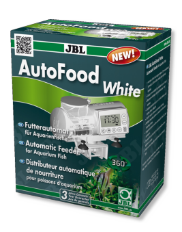
JBL AutoFood WHITE White automatic feeder for aquarium fish