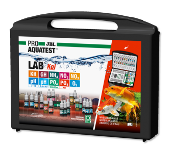
JBL PROAQUATEST LAB Koi

Professional test case for marine water analysis