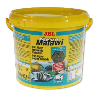
JBL NovoMalawi Main food flakes for algaeeating cichlids