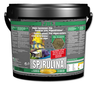
JBL Spirulina Premium main food for algaeeating aquarium fish