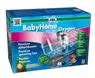
JBL BabyHome Oxygen

Premium spawning box complete kit with air pump