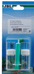
JBL component set for water tests