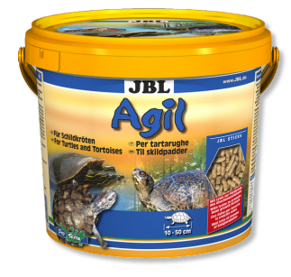
JBL Agil Main foodsticks for turtles 10 – 50 cm in size