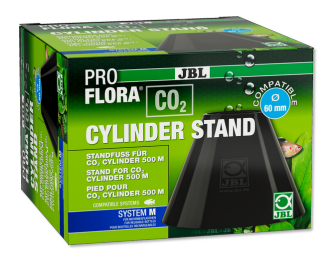
JBL PROFLORA CO2 CYLINDER STAND Stand for 500 g CO2 cylinders