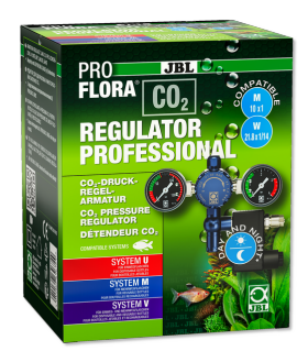
JBL PROFLORA CO2 REGULATOR PROFESSIONAL Pressure regulator with 2 displays & valve for CO2