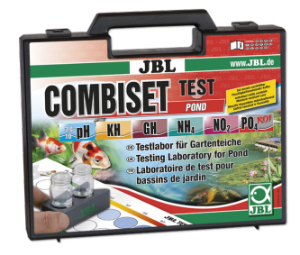
JBL Test Combi Set Pond

The most important water tests for garden ponds