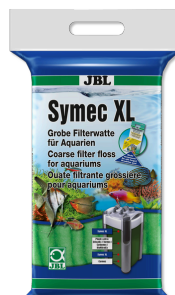
JBL Symec XL Coarse filter wool to remove all types of water cloudiness