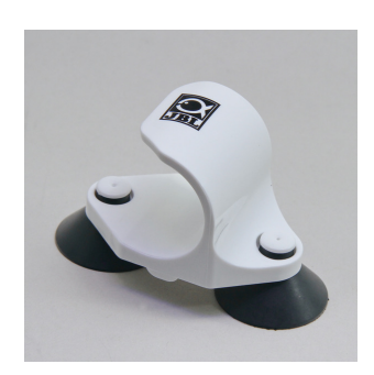
JBL PF Direct mounting, complete