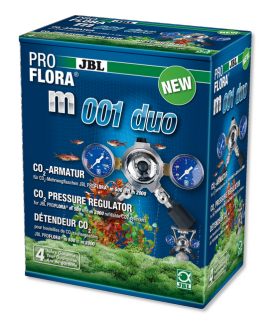
JBL PROFLORA m001 duo

Fitting to reduce pressure for 2 CO2 diffusers