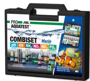
JBL PROAQUATEST COMBISET Marin

Test case for water analyses in marine aquariums