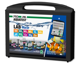
JBL PROAQUATEST LAB Marin

JBL PROAQUATEST LAB Test case with 13 water tests for freshwater analysis