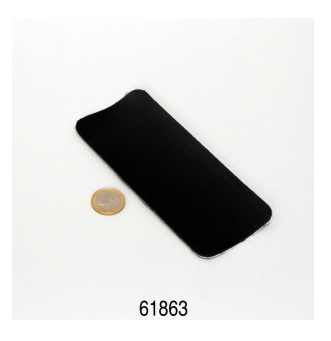
JBL Floaty Pad