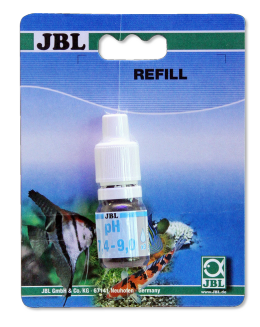
JBL pH Test 7.4-9.0 pH test in aquariums and ponds in the range 7.4-9.0