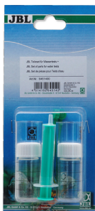
JBL component set for water tests