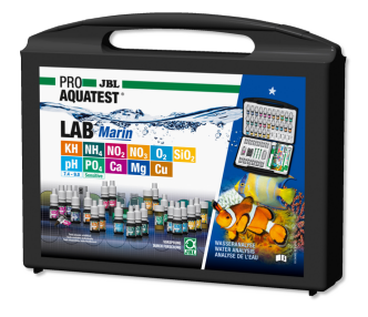
JBL PROAQUATEST LAB Marin

Professional test case for marine water analysis