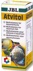
JBL Atvitrol Multivitamin drops for aquarium fish