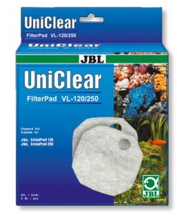
JBL FilterPad VL Cotton fleece for CristalProfi aquarium filters