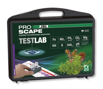
JBL Testlab ProScape Test case for water analysis in plant aquariums