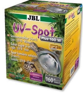
JBL UV-Spot plus UV spotlight with daylight spectrum for terrariums