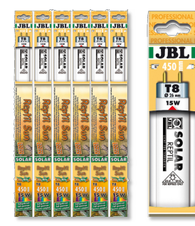
JBL SOLAR REPTIL SUN T8 Special T8 terrarium fluoresc. tube for desert animals