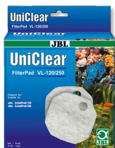
JBL FilterPad VL Cotton fleece for CristalProfi aquarium filters