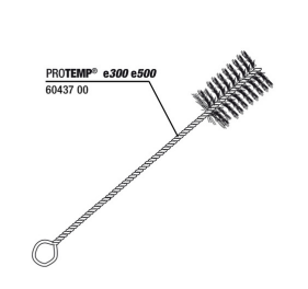
JBL ProTemp e300/500 cleaning brush