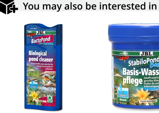
JBL BactoPond Bacteria for biological purification of the pond