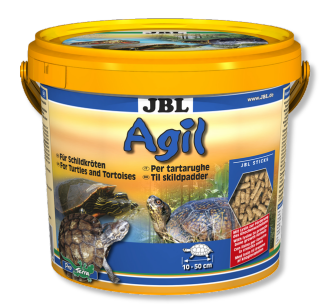
JBL Agil Main foodsticks for turtles 10 – 50 cm in size