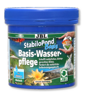
JBL StabiloPond Basis Basic care product for all garden ponds