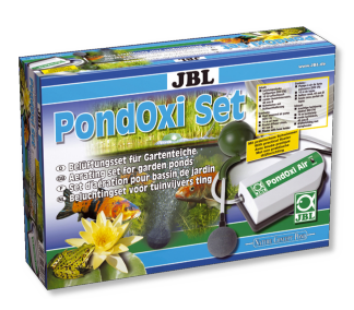
JBL PondOxi-Set Aeration set with air pump for garden ponds