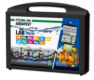
JBL PROAQUATEST LAB Marin

Professional test case for marine water analysis