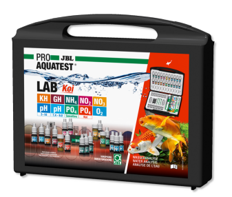
JBL PROAQUATEST LAB Koi

Professional test case for marine water analysis