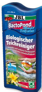
JBL BactoPond Bacteria for biological purification of the pond