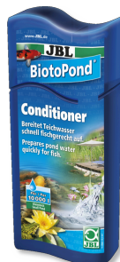
JBL BiotoPond Water conditioner for ponds