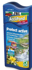
JBL AccliPond Water conditioner for ponds