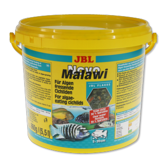
JBL NovoMalawi Main food flakes for algaeeating cichlids