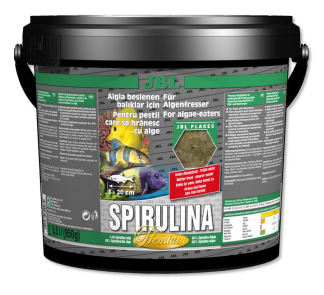
JBL Spirulina Premium main food for algaeeating aquarium fish