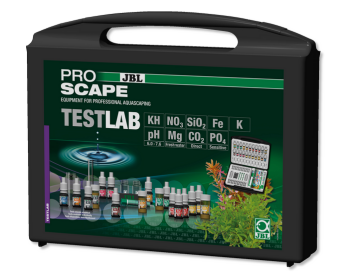
JBL PROAQUATEST LAB PROSCAPE Test case for water analysis in plant aquariums