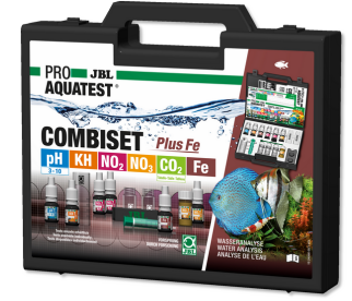
JBL PROAQUATEST COMBISET Plus Fe Test case with most important water tests + iron test