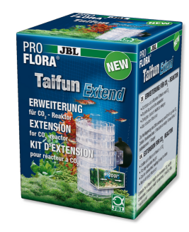
JBL PROFLORA Taifun Extend Extension for CO2 highperformance diffuser