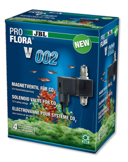
JBL PROFLORA v002 Noiseless solenoid valve