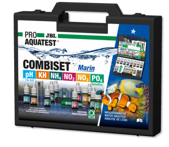
JBL PROAQUATEST COMBISET Marin Test case for water analyses in marine aquariums