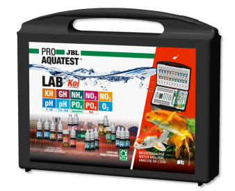
JBL PROAQUATEST LAB Koi Professional test case for koi and garden ponds