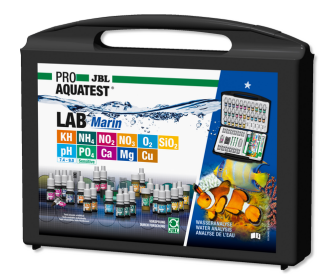
JBL PROAQUATEST LAB Marin

Test case for water analysis in plant aquariums