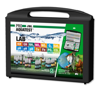
JBL PROAQUATEST LAB Test case with 13 water tests for freshwater analysis