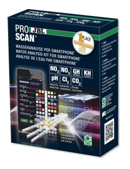
JBL PROSCAN Water test with analysis via smartphone