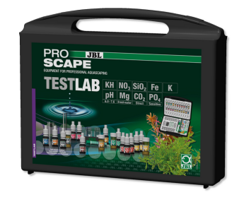
JBL PROAQUATEST LAB PROSCAPE

Test case for water analysis in plant aquariums