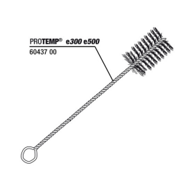
JBL ProTemp e300/500 cleaning brush