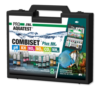
JBL PROAQUATEST COMBISET Plus NH4

Test case with most important water tests + iron test