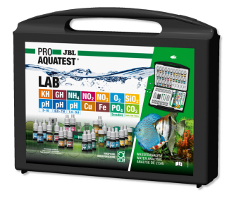
JBL PROAQUATEST LAB

Test case with 13 water tests for freshwater analysis