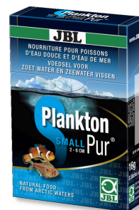
JBL PlanktonPur SMALL Treats for small aquarium fish