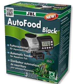
JBL AutoFood BLACK Black automatic feeder for aquarium fish