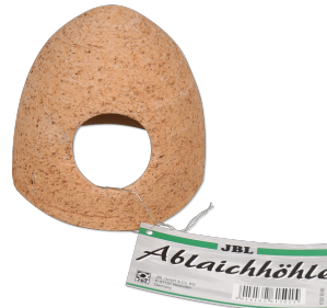
JBL Ceramic spawning cave Ceramic cave for freshwater aquariums