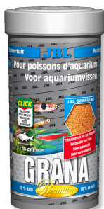
JBL Grana Premium main food granulate for small aquarium fish