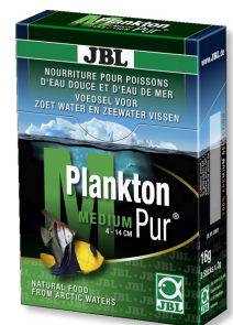
JBL PlanktonPur MEDIUM Treats for large aquarium fish