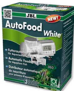
JBL AutoFood WHITE White automatic feeder for aquarium fish