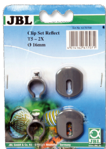
JBL SOLAR REFLECT Clip Set Holder for fluorescent tubes