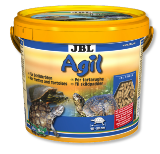
JBL Agil Main foodsticks for turtles 10 – 50 cm in size