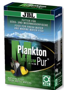
JBL PlanktonPur MEDIUM Treats for large aquarium fish