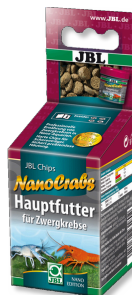
JBL NanoCrabs Main food for dwarf crayfish