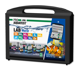
JBL PROAQUATEST LAB Marin

Quick test to determine the calcium content