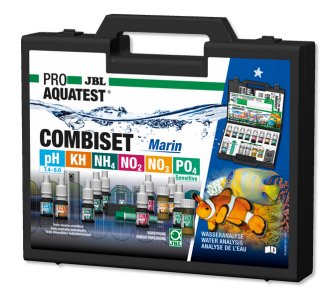
JBL PROAQUATEST COMBISET Marin

Professional test case for marine water analysis