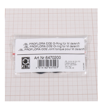
JBL PROFLORA CO2 Oring for m