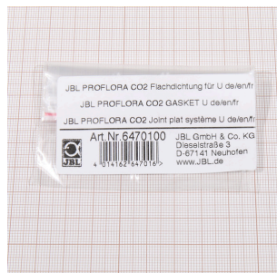
JBL PF CO2 flat gasket for u