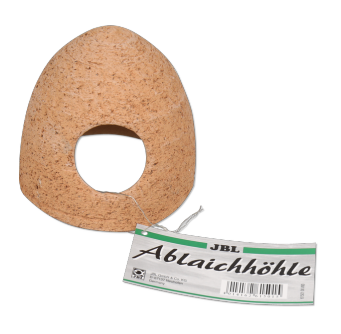
JBL Ceramic spawning cave Ceramic cave for freshwater aquariums