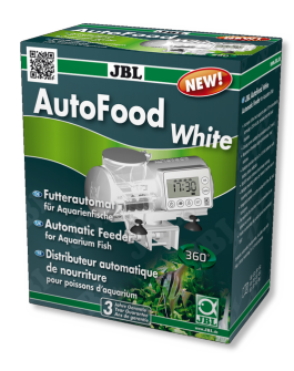
JBL AutoFood WHITE White automatic feeder for aquarium fish