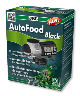
JBL AutoFood BLACK Black automatic feeder for aquarium fish