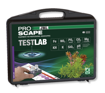
JBL Testlab ProScape Test case for water analysis in plant aquariums