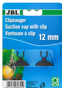
JBL suction cup with clip, 12 mm

Rubber suction pads with clips for objects with 12 mm