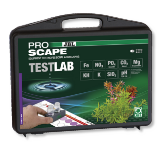
JBL Testlab ProScape Test case for water analysis in plant aquariums